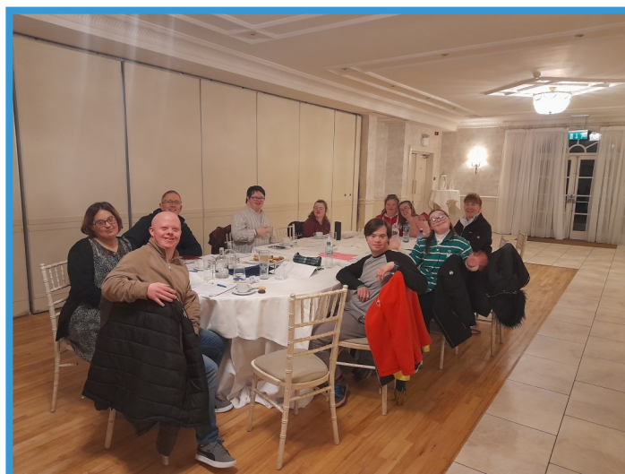
Louth Meath RAC