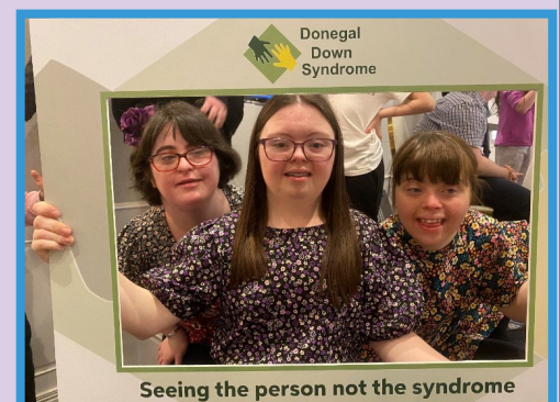
Seeing the person not the syndrome

2023 really was a huge step forward for people here in the Donegal branch for reconnection.